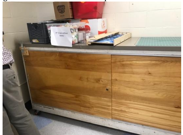
School Store Before

The store was named the Wolfpack Warehouse, and will be open several days a week during lunch periods. They have a wide variety of merchandise including school supplies, jewelry, stress balls, and other trinkets. Proceeds will go toward paying back the loan. Once the loan is paid, proceeds will go to charity.