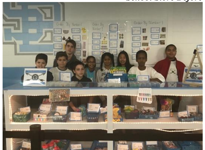
School Store After