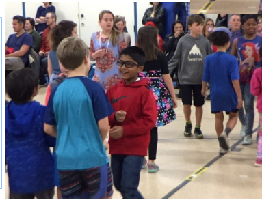
Don't forget to join us for a P.E. class. Check last week's Core for the schedule.