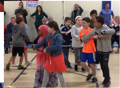
Part of Orchard School's Fine Arts Month