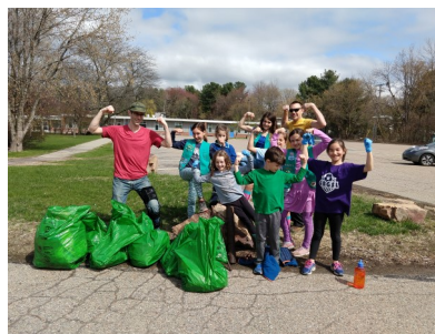
Girl Scout Troop 52011 and families showing off their power. They cleaned up at Orchard School on Saturday for Green Up Day filling 6-7 bags and a fun afternoon!